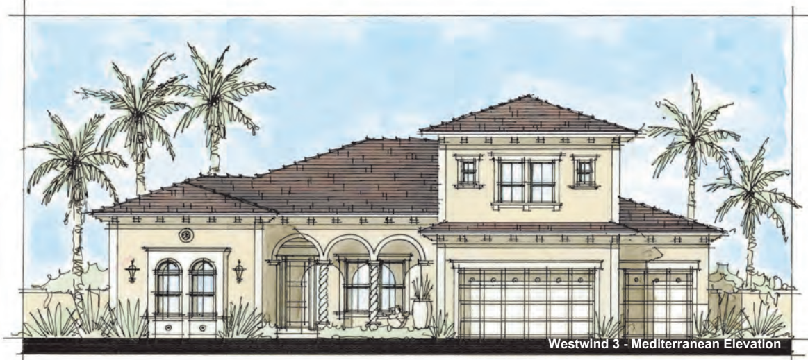
Westwind 3 - Mediterranean Elevation

$589,900 Available Early 2012 in Chapman Crossing